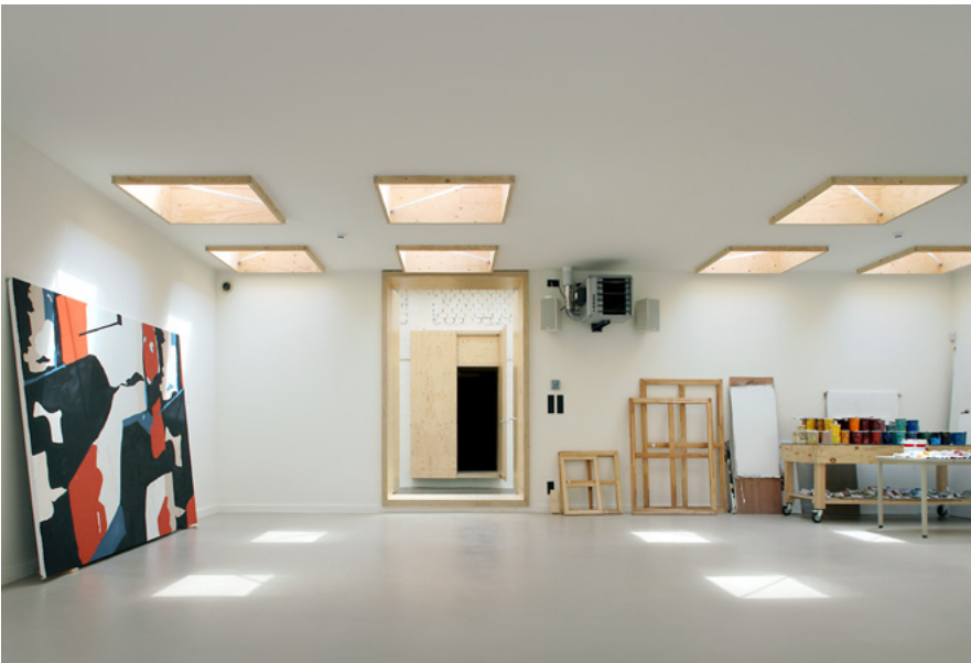
Koen van den Broek's studio in Antwerp (Belgium)